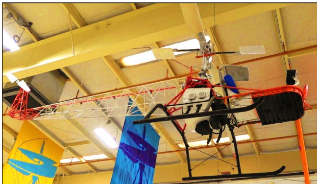
The "Glaticopter" is on display at the American Helicopter Museum in West Chester, Pa.