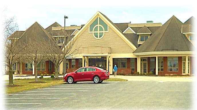
The Glatfelder Community Center (above) is part of SpiritTrust Lutheran at Sprenkle Drive, York, Pa.