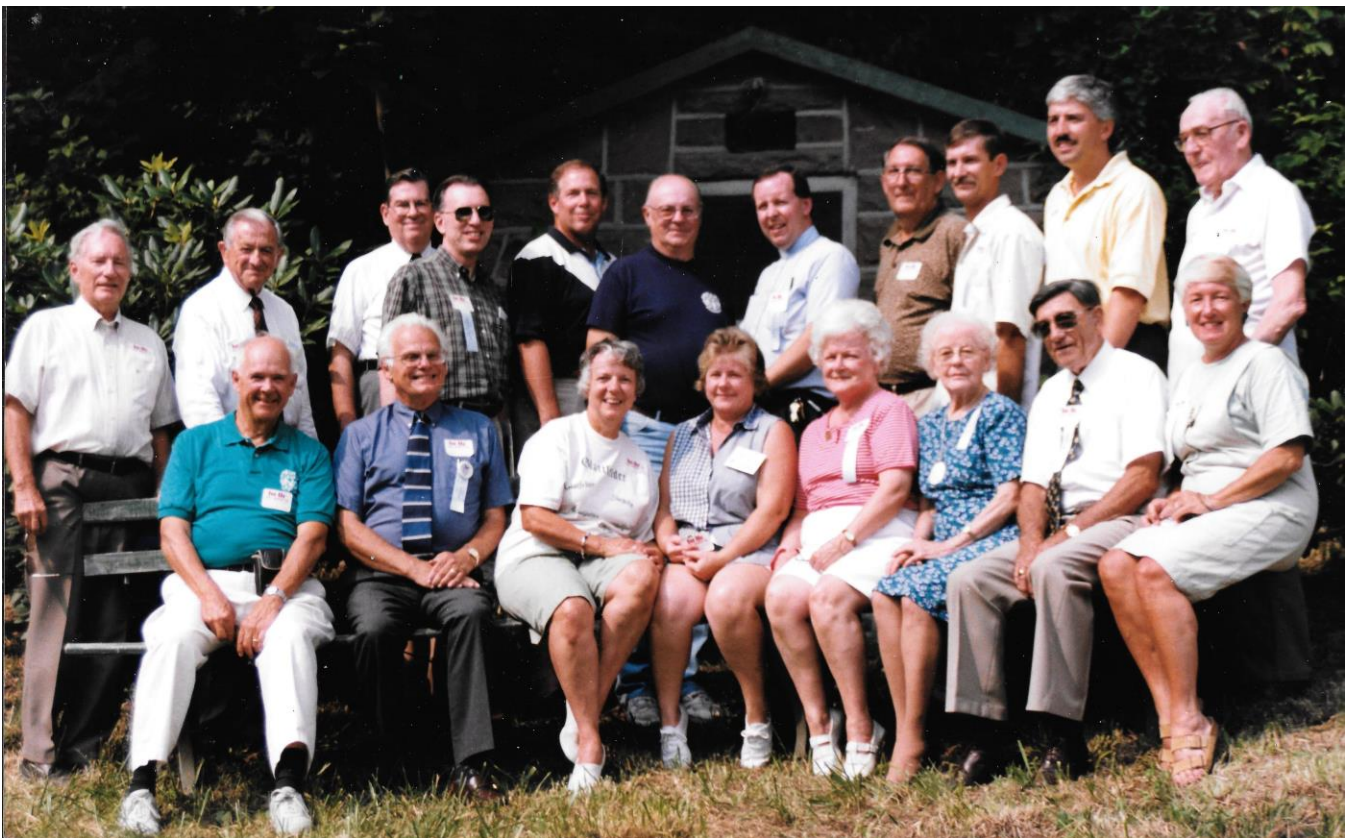
The entire CGAA Board of Directors at the 1993 reunion

The same sentiment exists today: All are welcome!! Our only caveat is that in planning the meals, we can provide only for those we know are coming. If you want to join us in eating, let us know you are coming. Or bring your own meal. Otherwise, the more, the merrier.