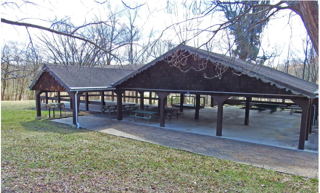
Current pavilion, extension and brick patio

The current pavilion and its extension have been in existence since 2003.