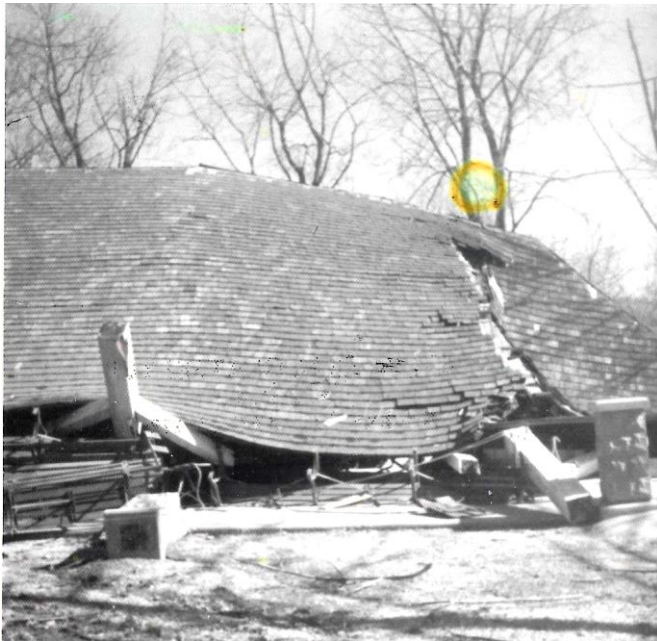
Tornado-damaged pavilion, March 1976