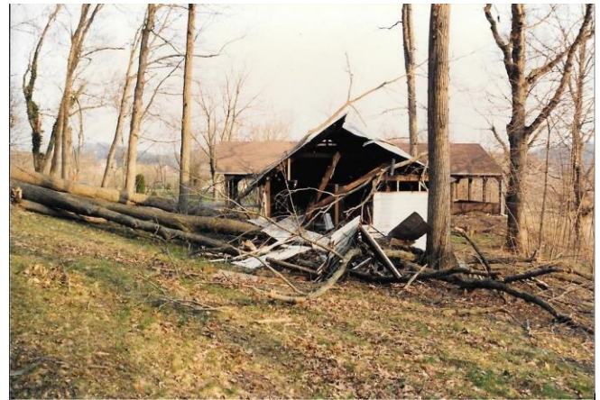
Refreshment stand damaged by fallen tree, April 1993